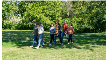
Walking Against Hunger!