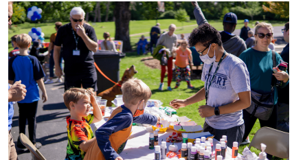
Kids Enjoying Pumpkin Painting Station