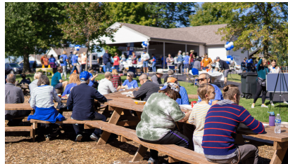
Community Partners Enjoying Complimentary Meal.

Additionally, we also hosted our Fall Festival in the midst of our Manna March. This was the perfect opportunity to celebrate all of our outstanding volunteers and church partners! There was a plethora of activities for everyone to enjoy along with some free food and live music! We would also like to give a huge congratulations to our 2020 award recipients. All of our amazing community partners are who make fulfilling our mission that much simpler!