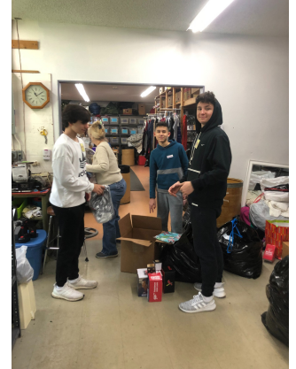
CBC volunteers in High Ridge.