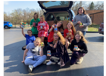
Wohlwend Elementary's Student Council

The Student Council at Wohlwend Elementary recently hosted a food & personal item drive. They dropped off the items at our South County location and we couldn't be anything but blessed to see the youth getting engaged in the community and helping our neighbors in need.