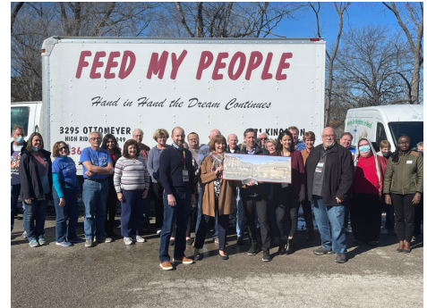
Feed My People with River City Casino representatives.