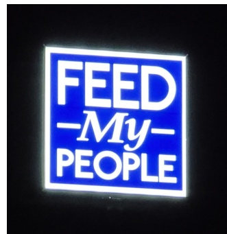
High Ridge's new sign.